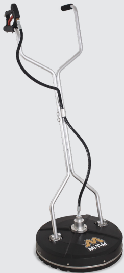
Rotary Surface Cleaners Use on decks, patios, sidewalks, parking lots and any other horizontal surface