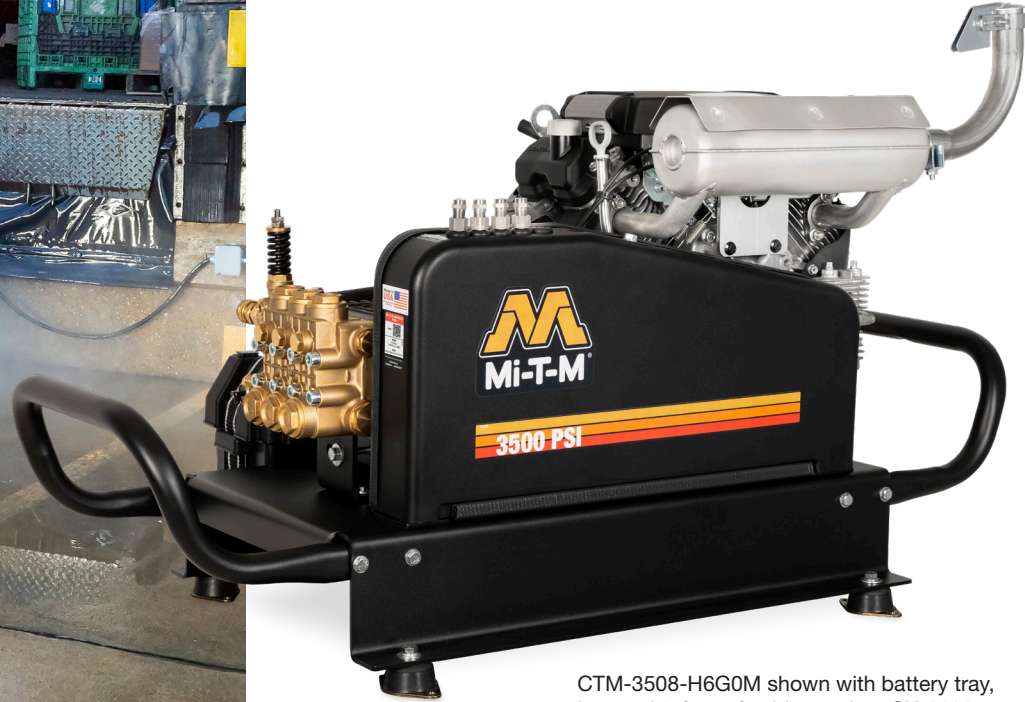
CTM-3508-H6G0M shown with battery tray, box and 2-foot of cables option, CX-0128

This cold-water truck-mount series is designed for mobile cleaning. Mount it to a truck or trailer with a water tank and clean anywhere, anytime. It's ideal for industrial cleaning and remote locations.