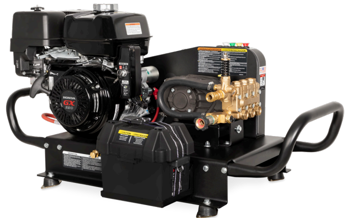
CTM-3005-H6G0M shown with electric start option, CX-0127 and battery tray, box and 2-foot of cables option, CX-0128